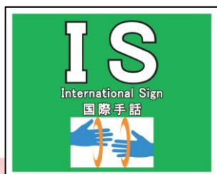
<International Sign sticker>