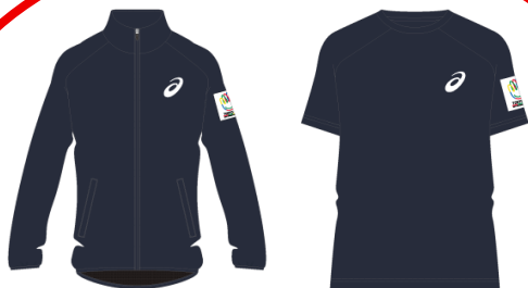
<Sign Language Interpreters>

Please be advised that some volunteers wearing pink uniforms may also display an “IS” sticker; however, their ability to provide assistance may be limited to basic expressions.