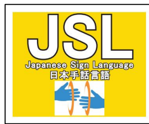
<Japanese Sign Language sticker>